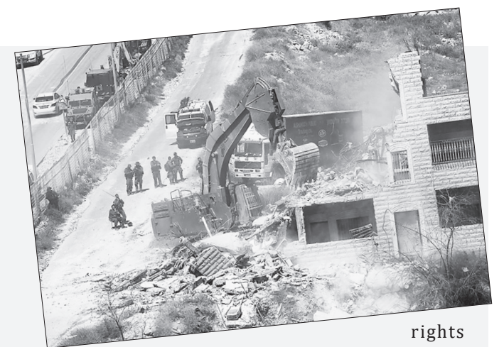
rights violations against Palestinians" by continuing to pursue the Jerusalem al-Quds District Court's decision on a pending appeal against the ordered eviction. He argued that the measure follows massive outcry over planned expulsions from Sheikh Jarrah neighborhood in occupied East Jerusalem al-Quds, where protests against the decision led to Israeli violence against Palestinians and the 11-day war on the Gaza Strip.