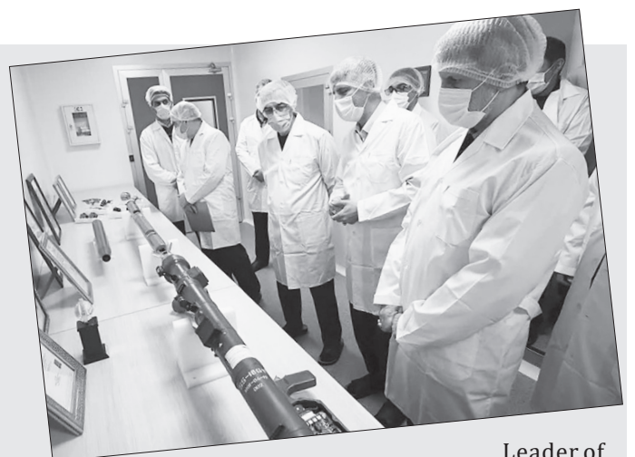
Leader of the Islamic Revolution Ayatollah Seyyed Ali Khamenei has repeatedly called for efforts to maintain and boost Iran's defense capabilities, hitting back at the enemies for disputing the country's missile program.

Iranian military experts and technicians have in recent years made great headways in manufacturing a broad range of indigenous equipment, making the armed forces self-sufficient in the arms sphere.