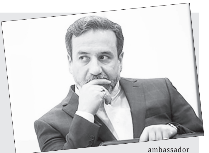
ambassador Araghchi said. in Tehran about the issue,"

"However, our consultations with all parties continue. On Wednesday evening, I had a long conversation with the Russian