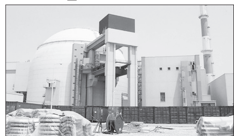
Iranian Energy Minister announced

on Sunday that the country plans to increase its nuclear power capacity from its current 1,000 megawatts to 3,000 MW in future.