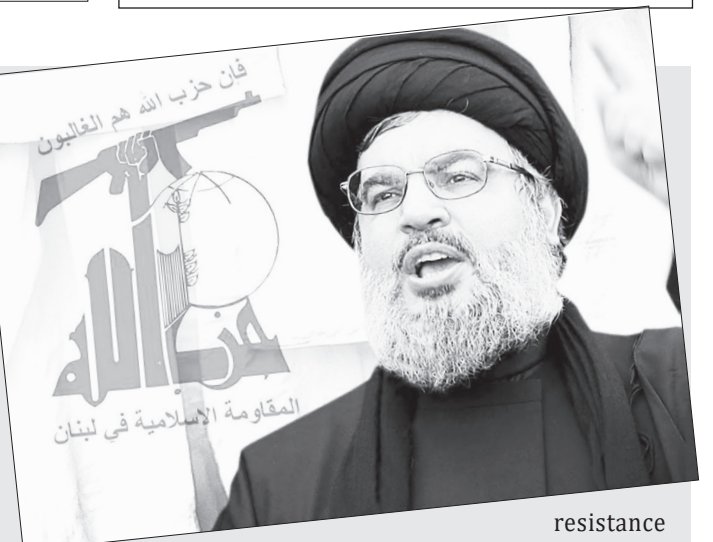
resistance movement's strengthening in

He also said that Israel "acknowledges" failure in preventing the