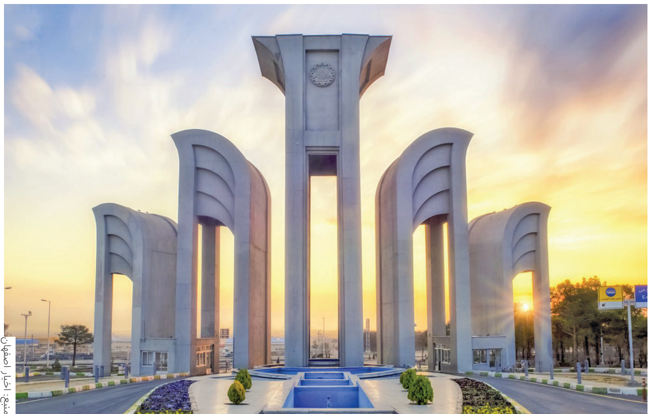
در دانشگاه صنعتی اصفهان به امضا رسید؛