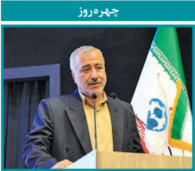
رئیس دانشگاه اصفهان:

مدیر عامل سازمان قطار شهری اصفهان: ورود دستگاه حفار مکانیزه به بزرگترین و عمیق‌ترین ایستگاه خطوط قطار شهری با حضور معاون عمرانی استانداری اصفهان: ۵۰ پروژه عمرانی در نایب افتتاح شد با بهره‌گیری از میدان مغناطیسی فرکانس پایین: درمان سلول‌های سرطانی